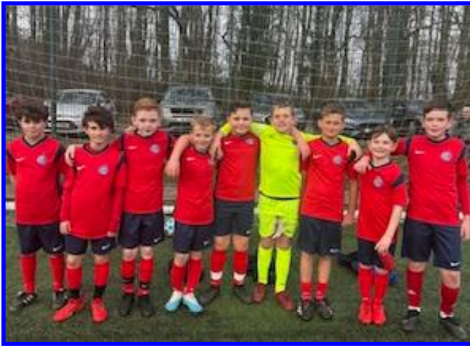
TDS Boys' Team 6 – 1 Kings Hill Boys' Team TDS Girls' Team 0 – 3 Kings Hill Girls' Team

On Tuesday 20th February, both of our football teams played Kings Hill Primary School at Kings Hill Sports Park. This was their first league match of the year and they all played fantastically. They showed great teamwork and all did the Discovery School proud in the effort and commitment they put into the match.